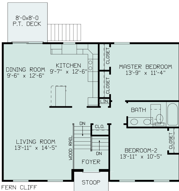
FERN CLIFF 36'-0" x 28'-0" 994 SQ. FT.

994 Total sq. ft. of living area, 994 sq. ft. additional unfinished lower level with four single windows and 3/0 walkout door, 2 bedroom, Master bedroom with two closets, One bath with 60" double bowl vanity with two sets drawers, tub/shower and skylight. 3/4" Oak hardwood flooring in foyer and wood railing between living room and foyer, Kitchen with pantry cabinet and eat at peninsula, Patio door to rear 8' x 8' pressure treated wood deck with access to the rear.